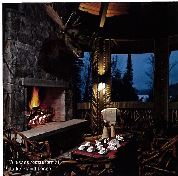
Artisans restaurant at Lake Placid Lodge