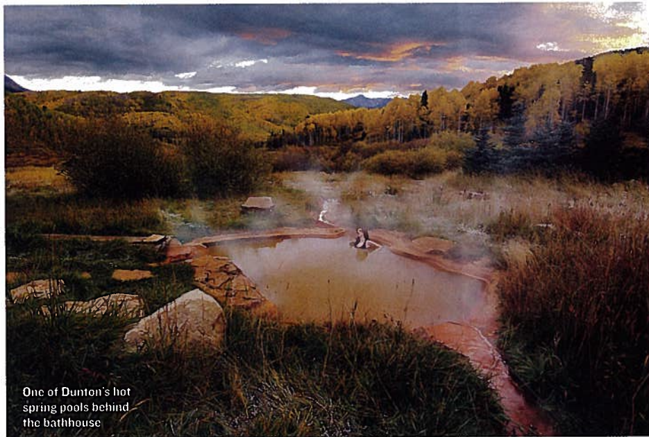
One of Dunton's hot spring pools behind the bathhouse